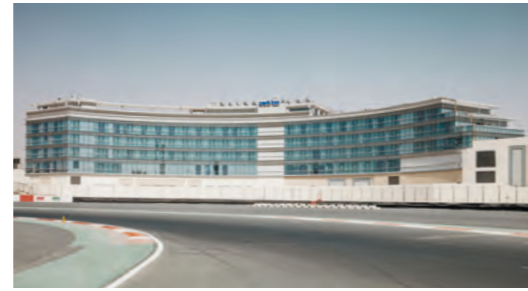
Views from the racing circuit

With a total of 147 guest rooms units, the interior design provides continuity to the racing story, but in a more subdued manner and through details like old racing photographs or bed covers which mimic chequered flags. Comfort is the main aim of the proposal. This is achieved with brightly painted walls and a choice of playful yet colorful furniture which enhances rest after a busy day racing or sightseeing in Dubai.