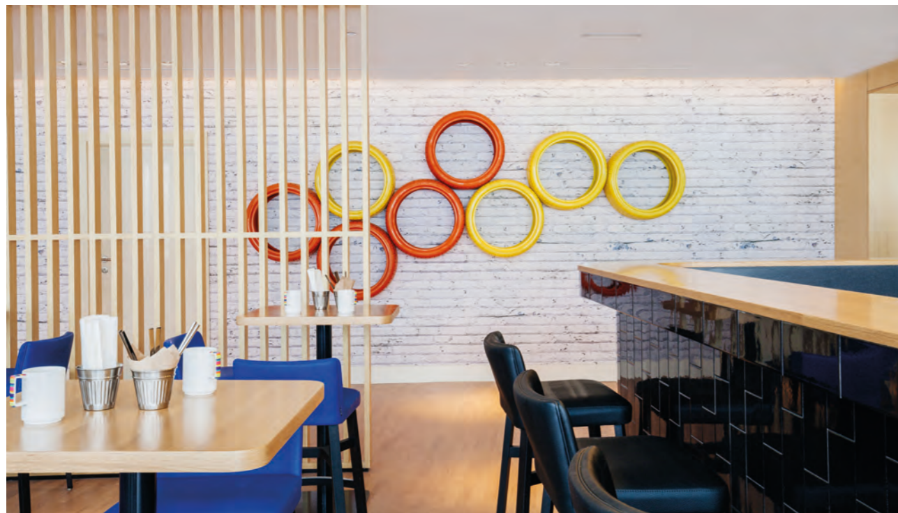
All day dining