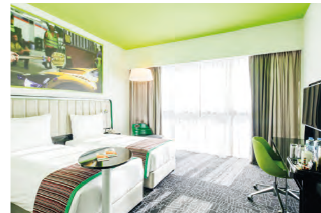
Typical guest room

Vintage cars suspended from the ceilings, corridors that resemble a circuit with pedestrian crossings located in front of the lifts, or different car parts like alloy wheels and tires painted in different colors which hang from the walls of the lobby and restaurants give a sense of adventure and fun, all in a contemporary and relaxed setting, with a strong sense of place. This twist complements the international style employed in the choice of materials and palettes in order to make the racing objets stand out and at the same time naturally integrating them into the decoration.