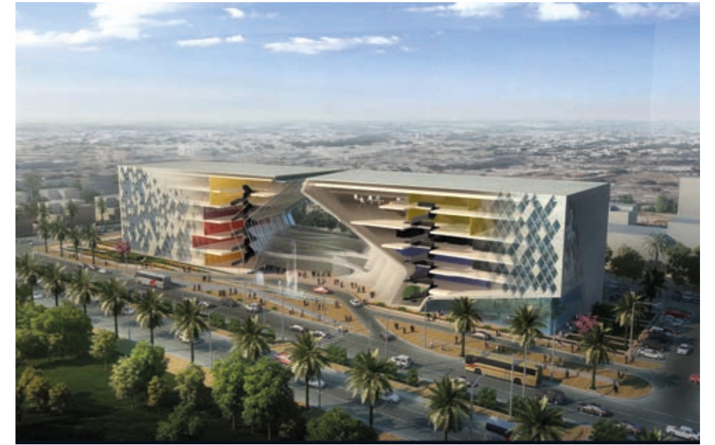
Exterior & interior view