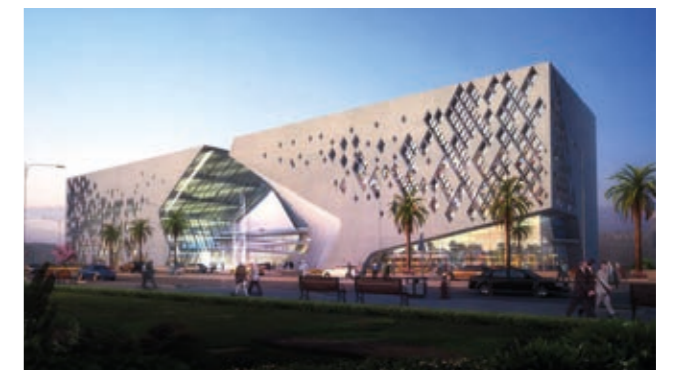
Exterior main facade

Given the extension of the building, one key issue was to fill the massive spaces with natural light. This is achieved through the diagonal-shaped openings in the facade, which resemble dots in Arabic Calligraphy, and allow plenty of light to enter the space. This is mimicked by the light-toned wood handrails which are designed with a similar zig-zag to those of the openings. This calligraphic reference is an allusion to the position the city enjoyed as a great centre of learning and theology at the beginning of its history.